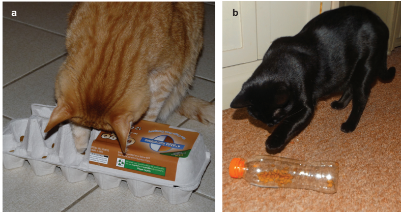
Figure 2 Two homemade puzzle feeders. (a) Like the feeders in Figure 1, this simple food puzzle also teaches food manipulation. (b) This dry food puzzle feeder encourages play and predation.

or they can be made at home easily and inexpensively (Figure 2). Puzzle feeders vary in their complexity, can be stationary or rolling, and can be designed for dry or wet foods. Some types require more effort than others on the part of the cat to obtain food, either by manipulation of the feeder or by the use of paws or tongue to reach the food. Usually simple, easily manipulated puzzle feeders should be introduced first. More information on the different types of puzzle feeders, and how to introduce them into the household feeding program, is available at www.foodpuzzlesforcats.com .